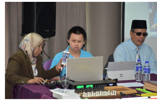
Blind-Technology sharing session by Malaysia Federation of the Blind