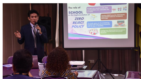
Zero-Reject Policy being explained by Ministry of Education Malaysia representative

MELAKA, 3rd – 17th March 2020 – Responding to current issues and importance of sexuality education especially self-exploration, sexuality needs and social interactions, SEAMEO SEN has conducted our ‘Best Practices in Teaching and Learning: Human Sexuality Education for Children with Special Needs’ course from 3rd to 17th March 2020 in Melaka, Malaysia.