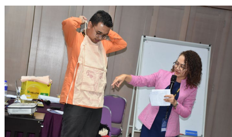
A point out of sexuality gender differences

The course was attended by 25 educators from SEAMEO Member countries (Malaysia, Indonesia, Thailand, Lao PDR, Cambodia and Myanmar). A line up of trainers for the course included Ministry of Health (MoH) Malaysia, MoE Malaysia and University of Tsukuba, Japan (representing MoE Japan). The course content included lectures, presentations, group activities, school visits and role-plays.