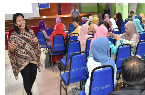
Bonding theory between the educators and the trainer