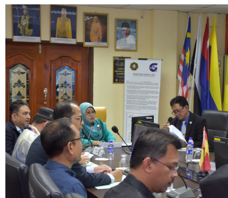
Workshop day 1: Presentation of research proposal by SEAMEO SEN