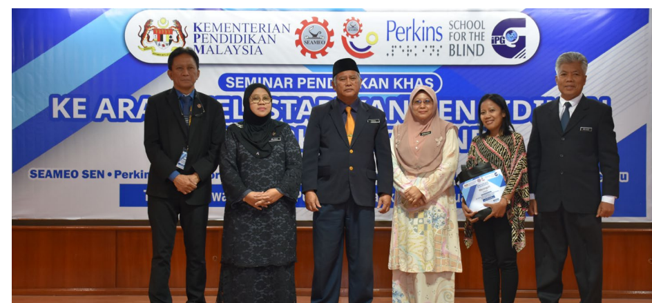
Photo session SEAMEO SEN with trainer and partners

The 1-day seminar was successfully moderated by a trainer from PERKINS International School for the Blind. The seminar touched on the understanding of deafblind, educational challenges and curriculum modification for learners with Multiple Disabilities. As a Regional Centre for Special Educational Needs, SEAMEO SEN is looking forward to have more collaboration with experts from local and international institutions to allow sharing of best practices of special education and inclusive teachers across the region.