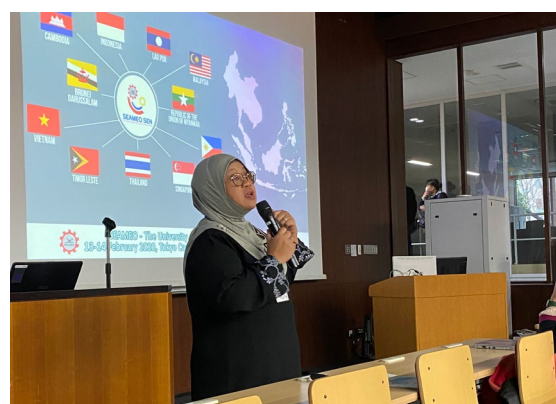
SEAMEO SEN Director as a speaker for Inclusive Education for Society 5.0 session

Tsukuba, 13th – 14th February 2020 – This year marks the 8th SEAMEO-The University of Tsukuba Symposium with the theme ‘Education for Inclusive Growth on 4th Industrial Revolution for Society 5.0’. The symposium provides a platform for clarifying the emerging issues in educations shaped by the fourth industrial revolution, and for sharing educational reform, challenges, and concerns within the scopes of global citizenship beyond the region, education for sustainable development, human characters developed through school subjects, and soft skills and lifelong learning in this fast-changing Society 5.0 driven by Industry 4.0.