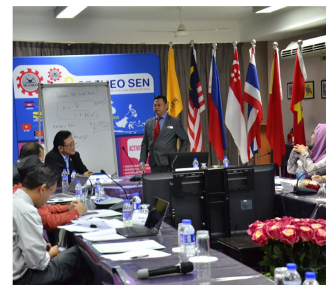
Workshop day 2: Discussion sessions on Chapter 3 (Instrument and Questionnaire)