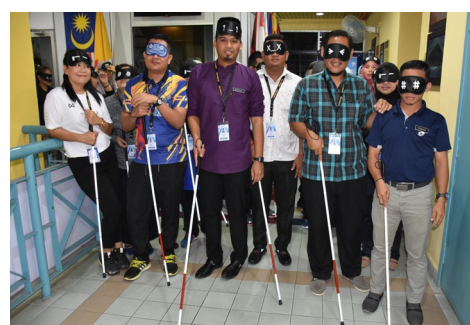
Blind walking session

The 4-week training course held in SEAMEO SEN, Melaka, Malaysia also involved a total of 11 trainers and facilitators from various institutions throughout Malaysia and Indonesia.