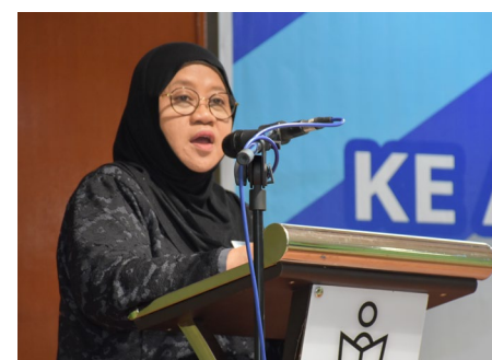
Opening speech from SEAMEO SEN Director

MELAKA, 26th February 2020 – In conjunction with the ‘Deaf-blind Education for Special Teachers’ course, SEAMEO SEN hosted a ‘Special Education Seminar – Ke Arah Melestarikan Pendidikan Bagi MBK Deafblind’ targeted for 202 educators of Special Needs from State Education Departments, Ministry of Education (MoE), Ministry of Higher Education (MoHE) as well as teacher