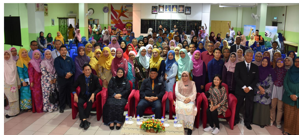
Photo shoot for all at the end of seminar

The 1-day seminar was successfully moderated by a trainer from PERKINS International School for the Blind. The seminar touched on the understanding of deafblind, educational challenges and curriculum modification for learners with Multiple Disabilities. As a Regional Centre for Special Educational Needs, SEAMEO SEN is looking forward to have more collaboration with experts from local and international institutions to allow sharing of best practices of special education and inclusive teachers across the region.