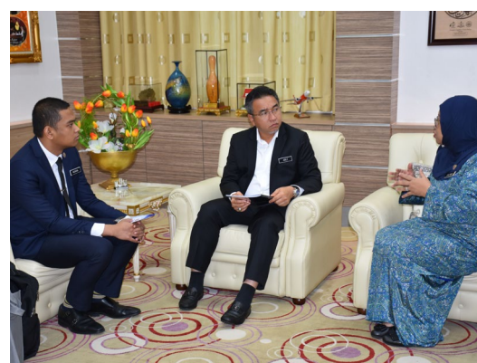
SEAMEO SEN Director presenting SEAMEO SEN Vision to Chief Minister of Melaka

Melaka, 24th February 2020 – SEAMEO SEN paid a courtesy call to the Chief Minister of Melaka, Malaysia at the State Government Office. The courtesy call to the Chief Minister of Melaka is part of the SEAMEO SEN’s ongoing efforts of engaging in the special education to all level of society. Discussions also revolved around the possibility of holding a future collaboration program to boost up the growth of special education agenda in Melaka.