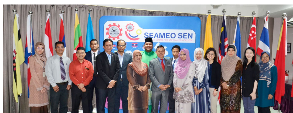
Photo session with the research committee

The expected final output of this research is to determine and develop a set of appropriate food options for children with ADHD and Down Syndrome based on medical research results to be offered in special education school as well as to promote advocacy materials on appropriate food.