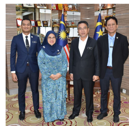
Group photo with the Chief Minister of Melaka