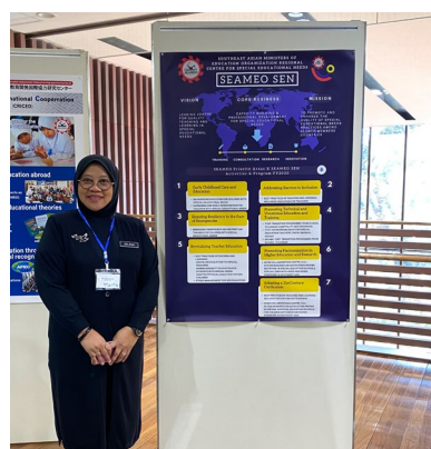
SEAMEO SEN Poster Presentation data

SEAMEO SEN presented under the sub-theme Inclusive Education for Inclusive Growth with the topic of “Sustainable Education Development for Person with Disabilities”. As the participants of SEAMEO-Tsukuba Symposium, SEAMEO SEN also contribute in poster presentation on the 11th February 2020 in providing information of our capacity building programs, research and networking activities.