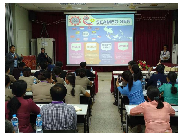
Introduction to Special Education and SEAMEO SEN