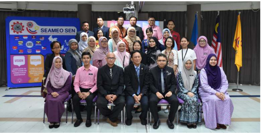
Photo session with SEAMEO's representatives and facilitator