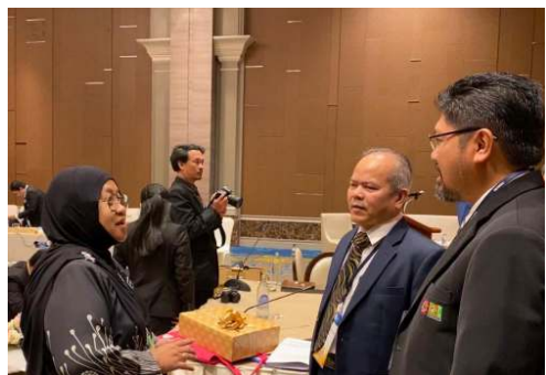
Discussion of collaborating among the SEAMEO centre

The 42nd SEAMEO HOM concluded in positive results, productive discussions, and close links between the SEAMEO Member Countries, SEAMEO Associate Member Countries, Affiliate Members, and Partners, which are necessary to further strengthen and support education, science and culture growth in Southeast Asia and beyond.