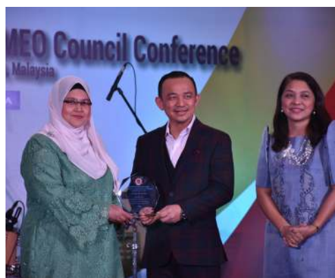
SEAMEO Awards Presentation