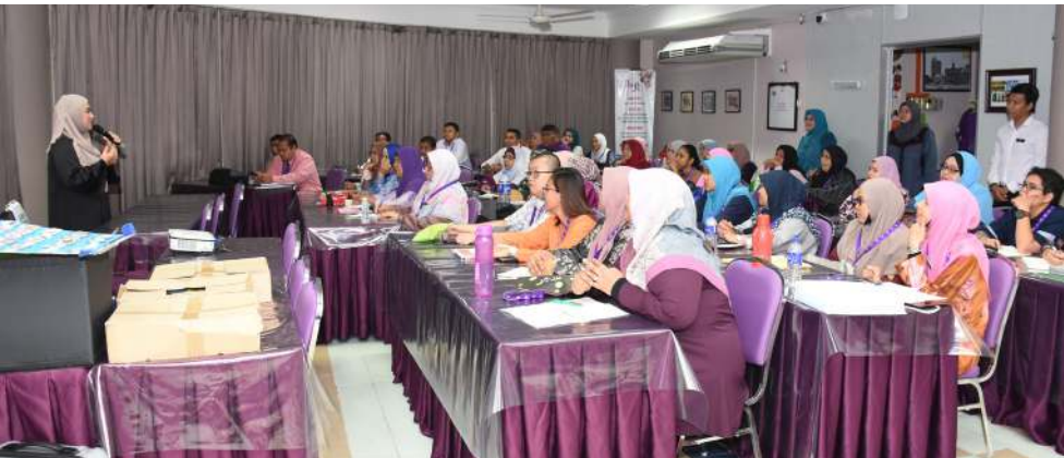
Sharing session about behavior management strategies and principles of behavior management