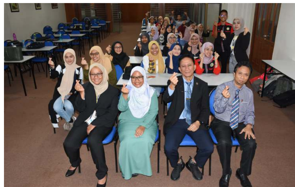
Photo session with the Young Leaders Club community