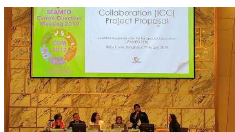
SEAMEO SEN proposal being presented by SEAMEO SEN Director

Five new Inter-Centre Collaboration (ICC) Proposals by 5 SEAMEO Centres were presented during Special Session for the SEAMEO Centre/Network. SEAMEO SEN has successfully presented our proposal on “Action Research on Advocating Proper Nutrition in Special Education Schools for Children with ADHD and Down Syndrome in Southeast Asia” and has been accepted as one of ICC project for year 2020.