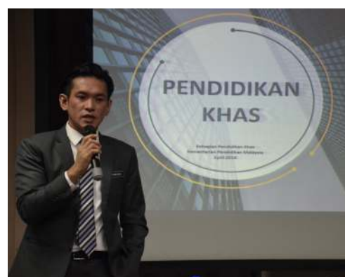
Representative from Malaysian Special Education Division shared about classroom management