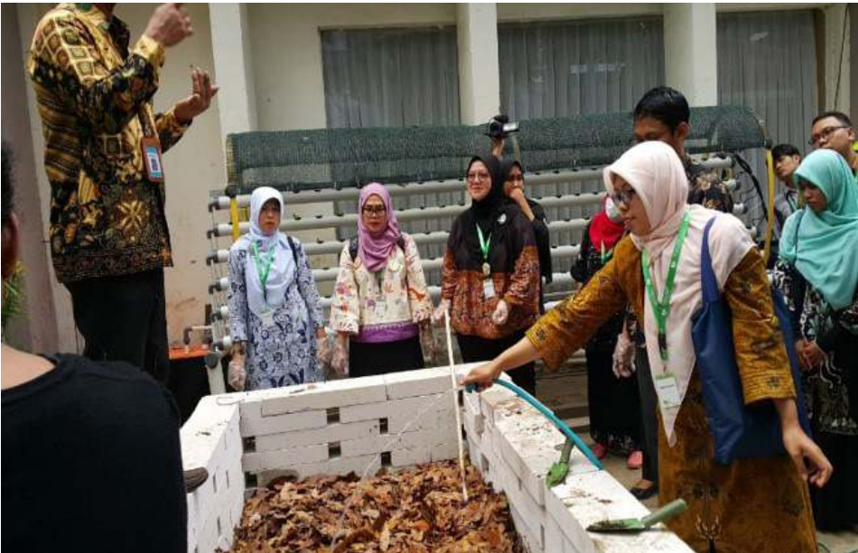
Participants also visited the Agri Hi-Tech Research and Development Centre of Ho Chi Minh at Cuci District