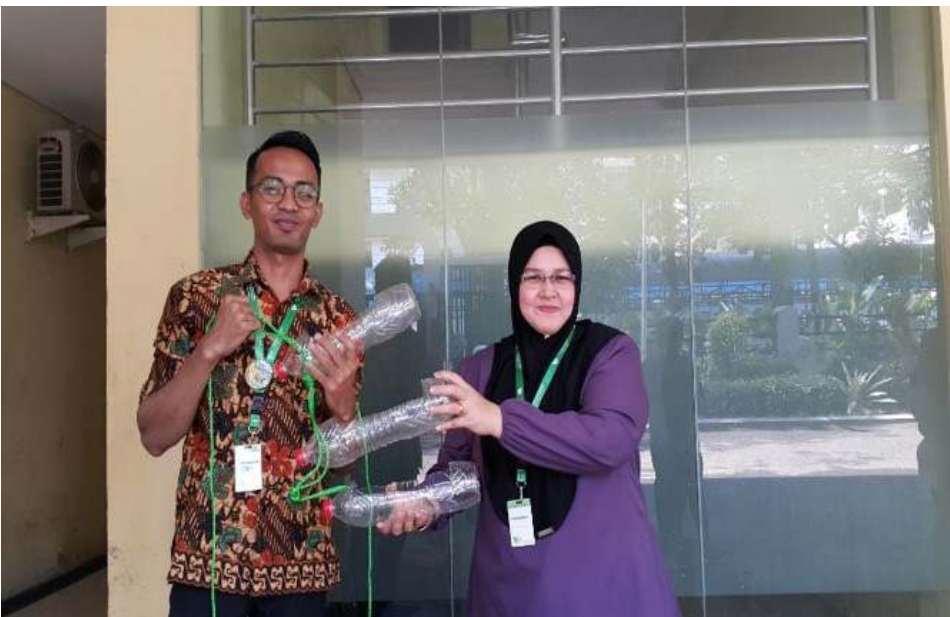
Group action activities