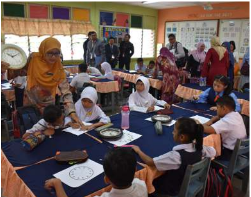
School Visit to study the pattern of inclusive students