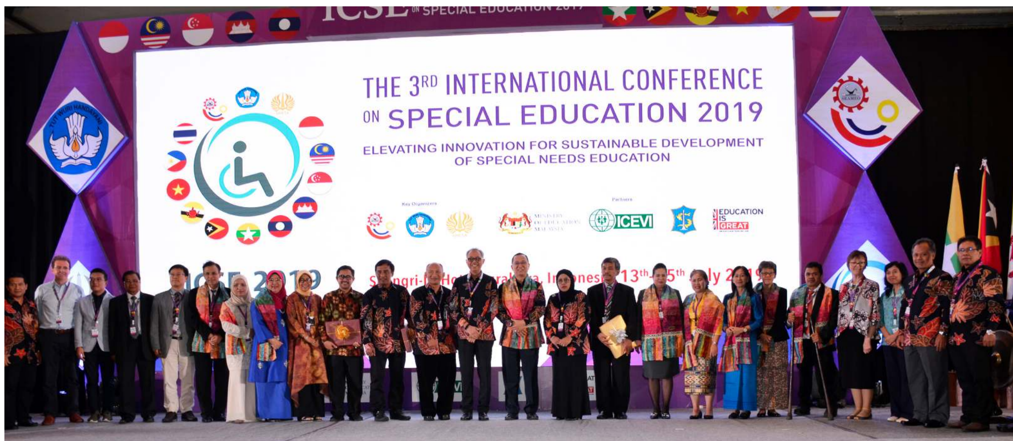
Representative from multi country and organizations

Under fifteen subthemes, the conference have amass a total of one hundred and forty three papers presented and discussed deliberately. ICSE 2019 received much publicity and media coverage in Indonesia and much support was given by the Ministry of Education and Culture Indonesia and UNESA.