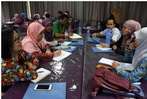
Addressing the issues and challenges towards special needs inclusive classrooms