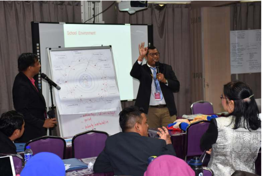
Sharing the ideas about action plan among the participants