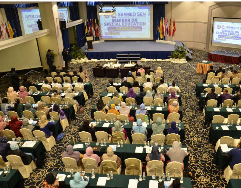
Closing Ceremony of seminar by the Director of Langkawi Education Office with the presentation of certificates and memento

BANDUNG, INDONESIA, 30th September – 3rd October 2019 –The Directorate of Secondary Education and Special Education Teacher Development, in collaboration with PPPPTK TK and PLB and SEAMEO, had hold Urban Agriculture Training for Special Education teachers, from 30 September to 3 October 2019 at the PPPPTK TK & PLB, Bandung West Java. This event was attended by 45 teachers from various regions in Indonesia and participants from Malaysia, Singapore and the Philippines, two people each.