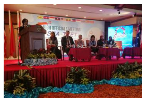
Progress Report on TVET Training for Special Education Needs Teacher and Proposal presented by SEAMEO SEN Director