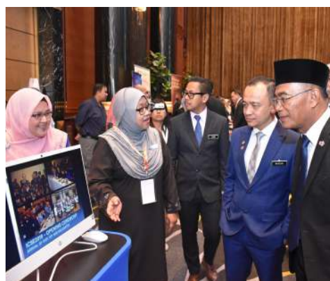
Booth Visit by the Malaysia Minister of Education and SEAMEO Council President

It featured multiple fora to discuss responses to the changing education landscape influenced by recent economic and social developments.