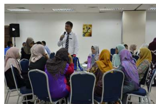
Discussion among the participants