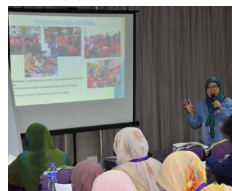
Malaysian Down Syndrome Association talked about teaching method of reading to students with down syndrome