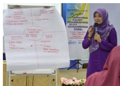
Action plan session

This workshop aims to create entrepreneur among special needs community, enhance special needs community household revenue and implement skill and value of entrepreneur among community through student as an entrepreneur agent. The workshop successfully conducted, and SEAMEO SEN hopes all the participants will practice and implement the knowledge and skill of entrepreneurship in their teaching session at school.