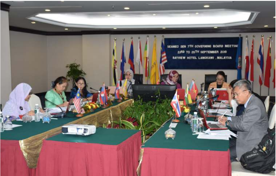
Seven (7) representative SEAMEO Country Members along with SEAMEO SEN Director & SEAMEO Secretariat Director

In summary, there were a total of seventeen (17) working papers are being discussed along with the presentation from GBM and the observers.