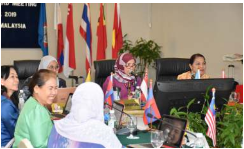
Each SEAMEO Country Members report presentation