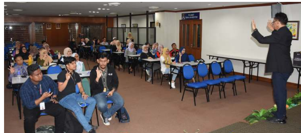
UiTM students from different courses attended the program

UiTM, MELAKA, 5th December 2019 – “Don’t Bother, Let’s Talk, ” program organized by the Young Leaders Club aims to increase the skills of students to learn Sign Language more deeply to communicate with people with disabilities in general. SEAMEO SEN was invited to teach the basics of sign language such as the alphabet and some easy sign language movements for students. This program attended by thirty-two (32) UiTM students.