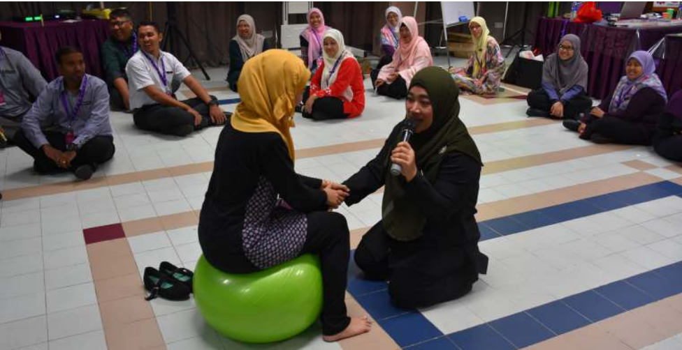
Balancing technique to help teachers to teach their students to improve motor skills