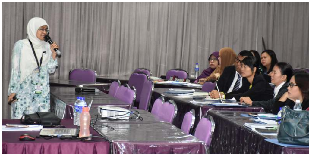
“Zero Reject Policy” was explained to ensures that all children in the country, including those with special educational needs (SEN)

MELAKA, 22nd October – 8th November 2019 – The training attended by 22 teachers of special education from Malaysia which, aims to enhance the capacity of teachers of Special Education, in particular, special education and mainstream teachers through better understanding in delivering classroom instructions and practices. The training also expects teachers to be able to develop IEP for their special needs students. It is our goal to also increase special education and mainstream teachers’ passion in teaching for special education.