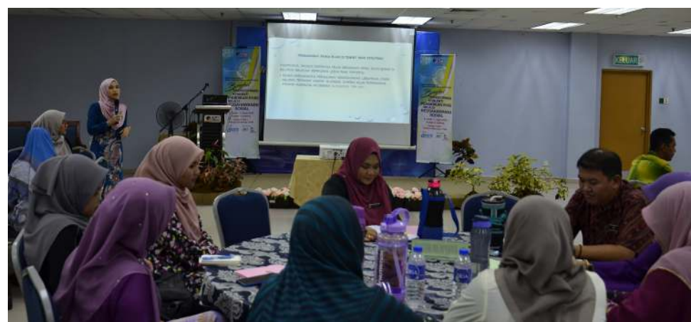
Brief introduction about entrepreneur

MELAKA, 31 July – 1 August 2019 – Social Entrepreneur for Special Education Community Workshop was held at Kampus Teknologi UTeM that comprised 29 Special Education Teachers, 10 UTeM students and 3 SEAMEO SEN staff. The workshop was organized by UTeM in cooperation with Research and Innovation Division, SEAMEO SEN.