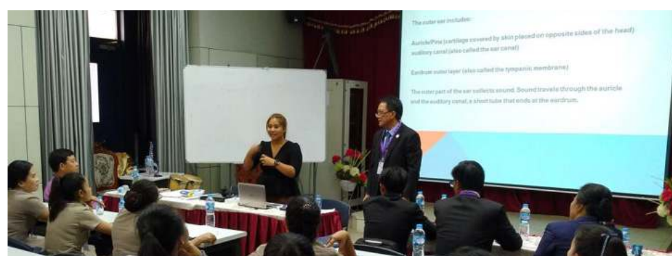
Hearing Impairment Session

LAO PDR, 19th – 21st August 2019 – Forty-eight (48) teachers and lecturers in Lao PDR completed a training course on Hearing Impairment, Visual Impairment and Autism Spectrum Disorder on 19-21 August 2019 at National University of Laos, Lao PDR. The in-country training was a collaboration between SEAMEO SEN, National University of Laos, Ministry of Education and Sports, Lao PDR and SEAMEO CED. Throughout the 3-day training, the participants received lectures and practical instructions regarding Hearing Impairment, Visual Impairment and Autism Spectrum Disorder where their learning will be focused on their respective content areas.