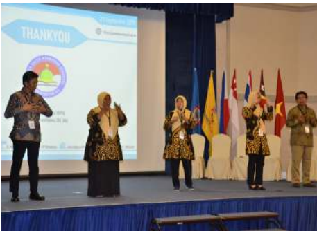
Inclusive Education Model of Galuh Handayani School, Surabaya, Indonesia