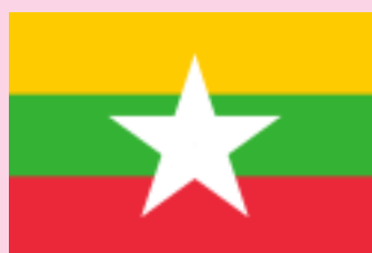
REPUBLIC OF THE UNION MYANMAR

Dagon University No. 11, Pyinnyaryeikthar Street Kamayut Township, Yangon Region REPUBLIC OF THE UNION MYANMAR