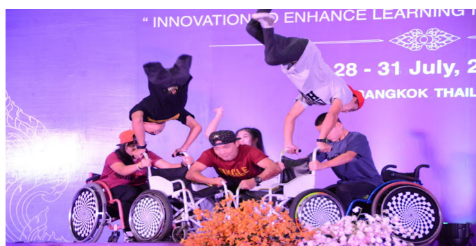
Performances by SEN students