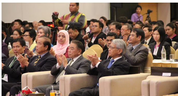
Welcome Remarks & Opening Address