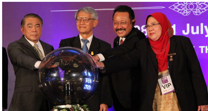
Official Launching of ICSE 2015